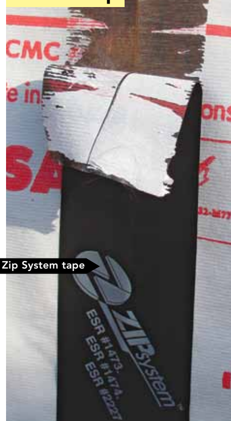
Zip System tape

Most brands of housewrap are easy to tape; I used Typar for my test. Three tapes tied for first place: 3M All Weather Flashing Tape, Zip System tape, and Siga Sicrall . The next-best tapes were the two housewrap tapes from Venture (Venture 1585CW-P2 and Venture 1585HT/W), which performed about the same. These two tapes cost so much less than the best-performing tapes that they are probably the tapes to choose. The worst-performing tape was Dow Weathermate.