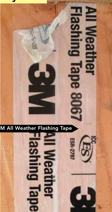
3M All Weather Flashing Tape

Plywood is always easier to tape than OSB; I used CDX plywood for the test. Three tapes tied for first place: 3M All Weather Flashing Tape, Siga Wigluv, and Siga Sicrall . Pro Clima Tescon No. 1 adhered well, but the tape itself is weak and ripped when it was removed. Zip System tape adhered well and was a credible runner-up. In descending order, the losers were Polyken Shadowlastic, Venture 1585CW-P2, and Dow Weathermate.