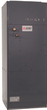
Indoor Unit: PVA-A30AA7